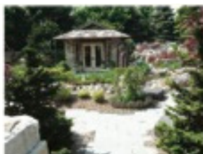
Asian Water Garden