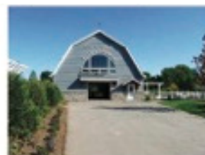
Landscape & Conference Barn