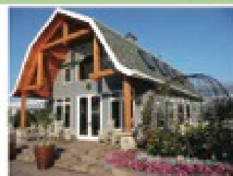
(Restrooms Inside) Greenhouse & Conservatory