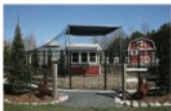
Children's Educational Farm