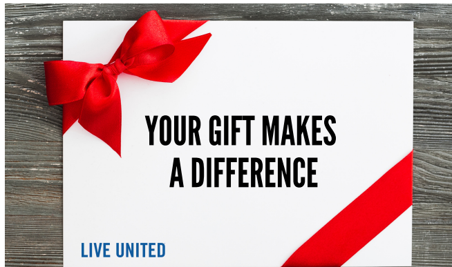
One example (above) of the impact in education made last year.

More youth are set up for success: 8,298 youth participated in programs to improve their future